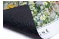
Detail: Foot Rest Colormaster