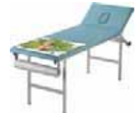
Examining table with foot rest