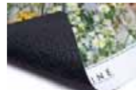
Detail: Foot Rest Colormaster