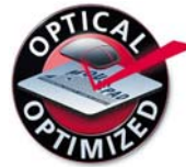
Optimized for optical mice