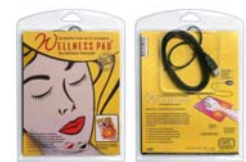
Packaging with product info, front side, back side