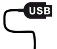
Electrical power via USB-port of the computer